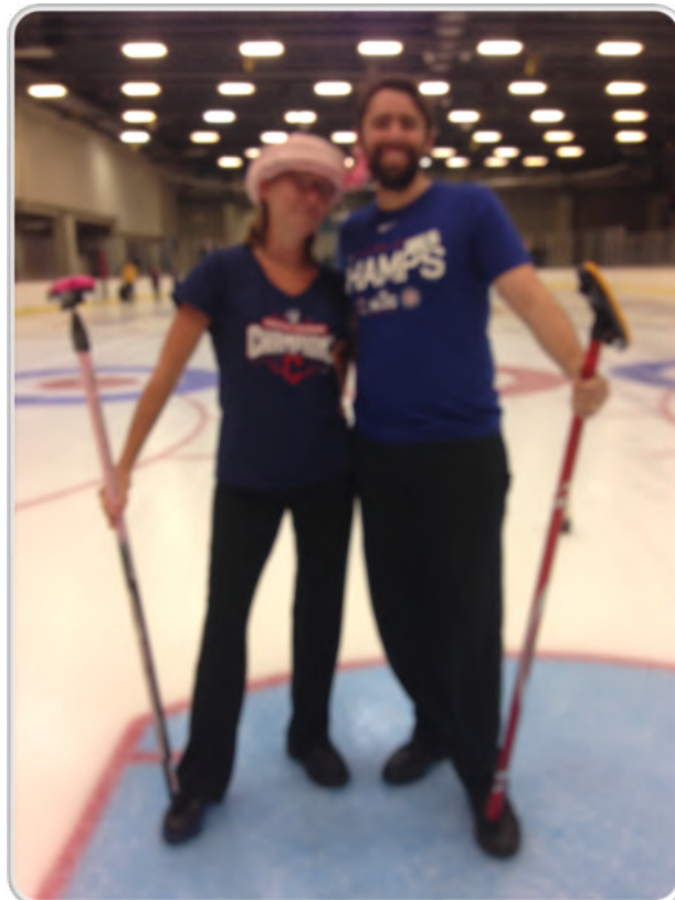
Photo blurred to protect the identities of the curlers.

While the Circle City Curling Club prides itself on being an open and welcoming environment, occasionally things can get a bit tense between members of the club. Indianapolis is about the same distance from both Cleveland, Ohio, and Chicago, Illinois, and so it is not surprising that just weeks into the Fall 2017 season, the Circle City Curling Club became a battleground between baseball fans. One unnamed curler admits, “I met [name redacted] during the spring curling league last April. We were playing his team, and my husband and I were laughing and joking with him during the game. I thought he was nice, but then he took his jacket off, and I saw who he really is.” The curler she was referring to revealed a Cubs t-shirt and told us, “I wasn’t trying to rub her face in it, but my team did beat hers [the Cleveland Indians] in the World Series in 2016, and well, yeah, maybe I was rubbing her face in it.” On the first night of fall league this year, the two were seen interacting in what appeared to be a civil manner, although the Cleveland curler’s husband did confide to this reporter that, “I was a bit nervous when I saw him walk in wearing that Cubs shirt again.” Another curler added, “I saw him point at his shirt and taunt her saying, “This isn’t coming off until the play-offs are over.”” At the time of writing this, the Cleveland Indians had taken an early exit from the 2017 post-season, while the Chicago Cubs had advanced to the next